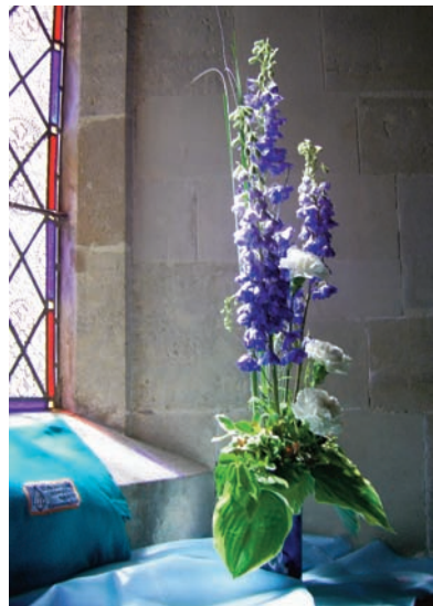
Blue delphiniums and white carnations representing a fountain of water.