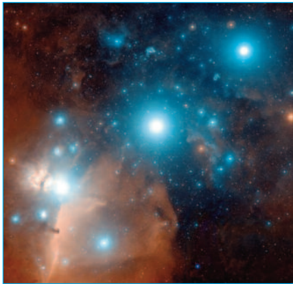
Orion's Belt – close up.

and against reincarnation, the historical reasons why modern-day banks and the Euro are bound to fail, and how crystals are being used to heal the world.