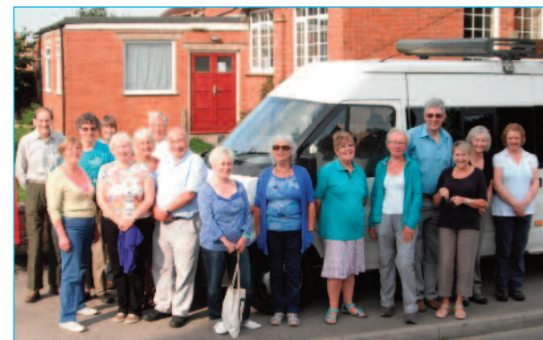
Off to visit Avebury and West Kennet Long Barrow in August.

But I think what stays with me most is the way so many of our members have improved their dowsing over recent years. It's wonderful to see how much more confident and capable we are all becoming. As we know, confidence is a large part of successful dowsing. And, as new people join, some of us are able to help them, as we were helped at first.