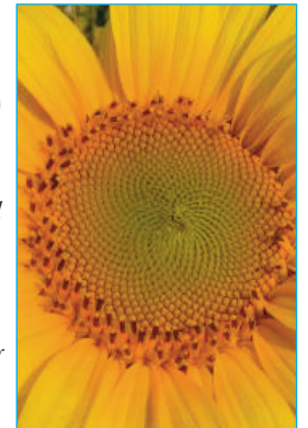
Photo: Spirals are nature's most frequently-used pattern.