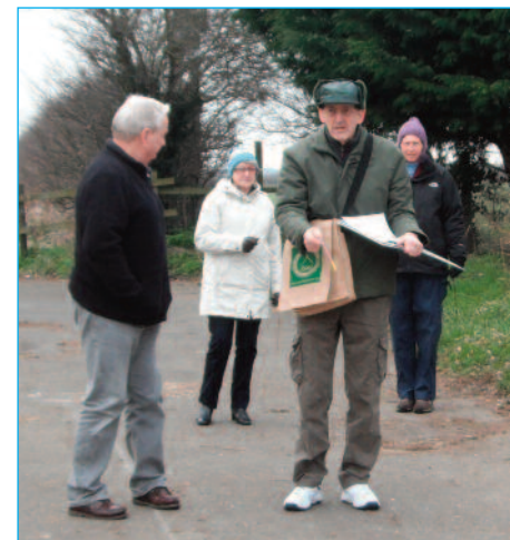
The faithful few dowsing for a blocked water pipe that was causing flooding in Slimbridge.