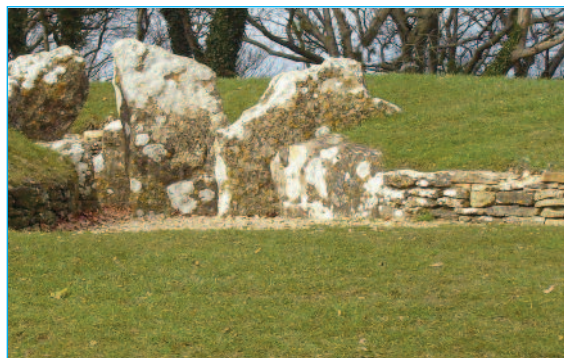
Above: Nympsfield long barrow, Coaley Peak.